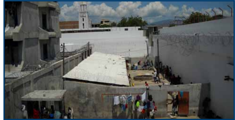
Penitentiary - 2009

The story you are about to read is a true composite, drawn from prison assessments in several countries. Unfortunately, this scenario is not unique to one location, but far too common in societies emerging from conflict or ruled by totalitarian regimes.