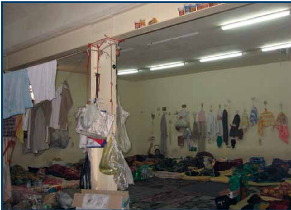
Overcrowded cell block (Middle East) – 2005