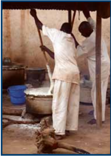
Prisoners making daily provisions (Africa) - 2011