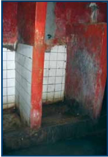
Unsanitary cell block toilets (West Africa) - 2007

Human Rights is one of the report's largest; its drafting requires significant dialogue between posts and DRL.