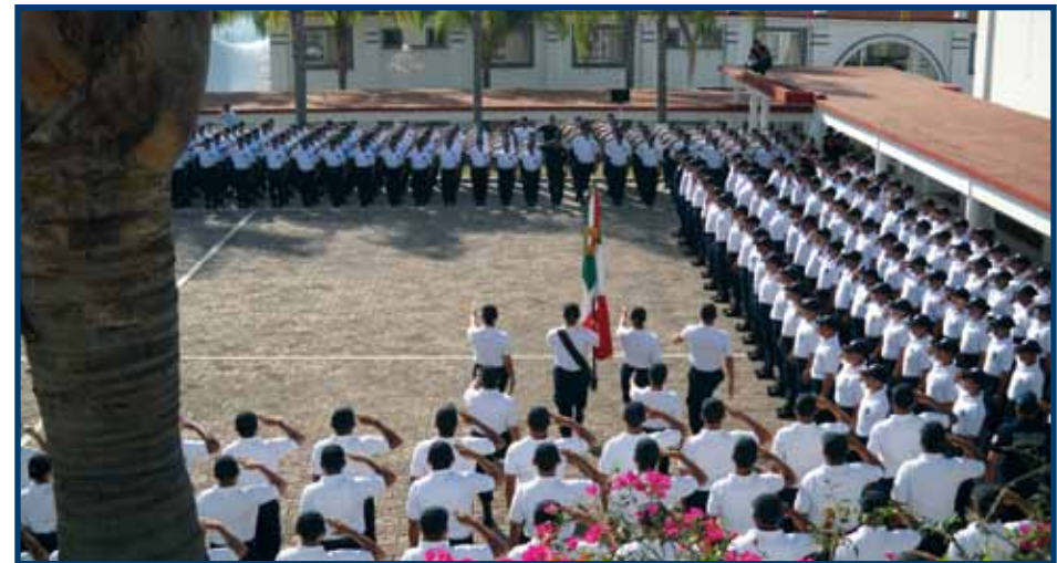
Penitentiary Officer Academy after Reforms (Latin America) - 2009

Many times, officials battling the challenges of improving prison security and conditions request assistance in identifying and purchasing technology. While there is nothing wrong with technology, it should be emphasized that no amount of technology will fix a dysfunctional system if there is a lack of well-trained, properly compensated, and motivated staff.