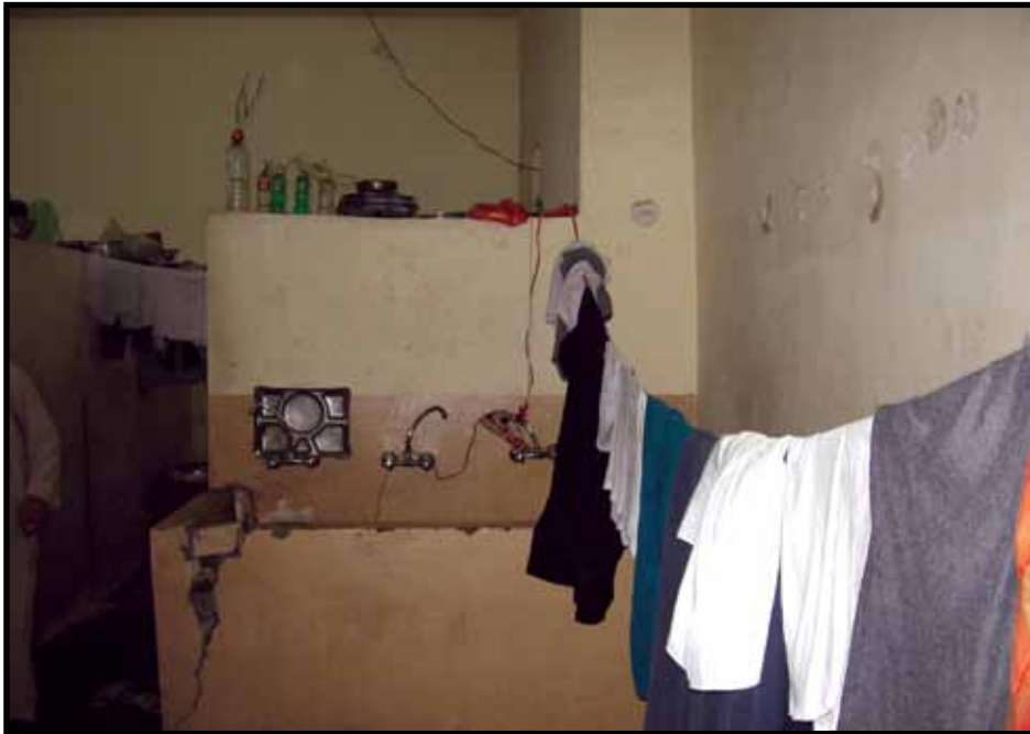
Dilapidated Cell Block Sink (Middle East) - 2005