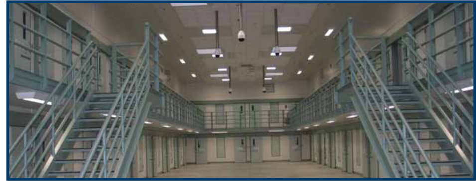
U.S. prison cell block - 2010

In early 2011, there were approximately 2.3 million people incarcerated in the United States. Of these, just over 210,000 were serving in FBOP facili-