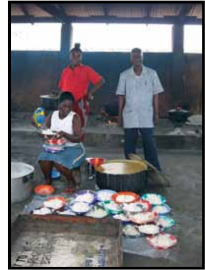
Staff cooking in open, wood-fired kitchen (Africa) - 2007

The director led them out of the clinic, down a dark corridor with wires hanging from destroyed sockets, up a set of flimsy wooden stairs, through a locked door, and onto the perimeter wall. Below the Americans was a swirling mass of prisoners, dressed in civilian clothes and apparently engaged in various activities, including card-playing and smoking. The faint odor of marijuana was noticeable amid the pungent reek of unwashed prisoners,